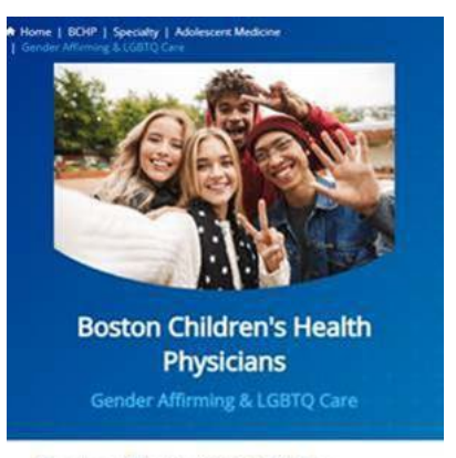
Gender Affirming & LGBTQ Care

The manipulation of the pictures demonstrates the instigators' intentional disinformation designed to incite and inflame. The day after this was posted, one of the other instigators reposted the same manipulated image and the telephone number for the Center for Gender Surgery: "Give Boston childrens a call to let them know how you feel about the mutilation of healthy children." That weekend, the Center received multiple menacing voicemails discussing gender-affirming care including one from a male caller who stated "Listen fucking closely... you're sick, fucking disgusting human. It's fucking disgusting what you do. I hope somebody finds you and fucking runs you over with a fucking bus. You're fucking sick." Another caller left a voicemail message stating "you are mutilating children and the blood will be on your hands."