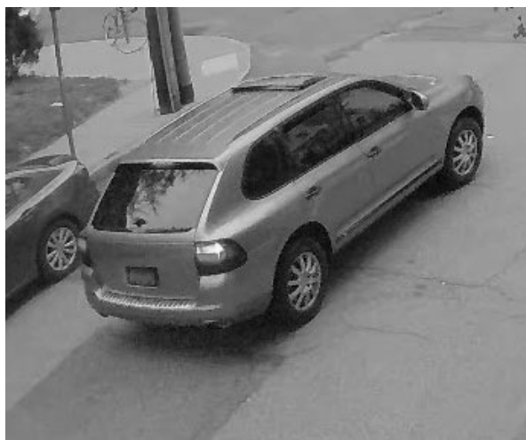
Figure 1 CCTV Image of Porsche at scene of Brookline robbery

17. Video surveillance footage shows that at approximately 9:33 p.m., a Porsche Cayenne, similar to the one seen in the Brookline Spa robbery was driving near the Stoneham Spa, 4 departs the area, and does not appear on surveillance footage again. At approximately 9:49 p.m., a Jeep drove to the rear of the Stoneham Spa in the same direction as the Porsche Cayenne. Shortly thereafter, three masked men, one of whom was armed with a firearm, entered the Stoneham Spa and robbed it.