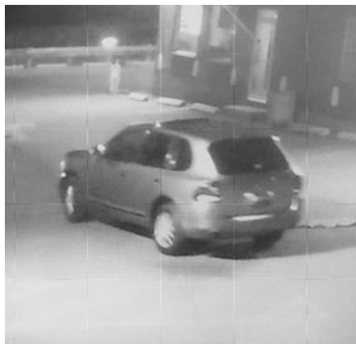
Figure 2 CCTV footage of Porsche Cayenne at scene of Stoneham robbery